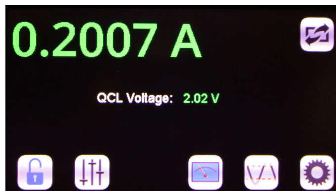
Figure 2. Monitor Screen