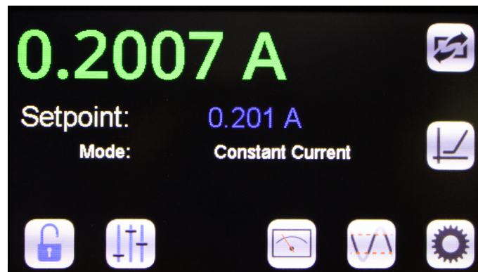
Figure 1. Control Screen

Due to their unique construction, QCLs operate with high power in the near-IR through terahertz ranges. These wavelengths are particularly suited to detection of molecules significant to humans. Applications for the lower noise QCL driver include: remote detection of explosive materials, medical diagnosis using the breath, non-invasive glucose testing, emissions monitoring, and pharmaceutical process quality control. Additional applications include anesthesia and hospital air quality monitoring, leak detection, and remote imaging.