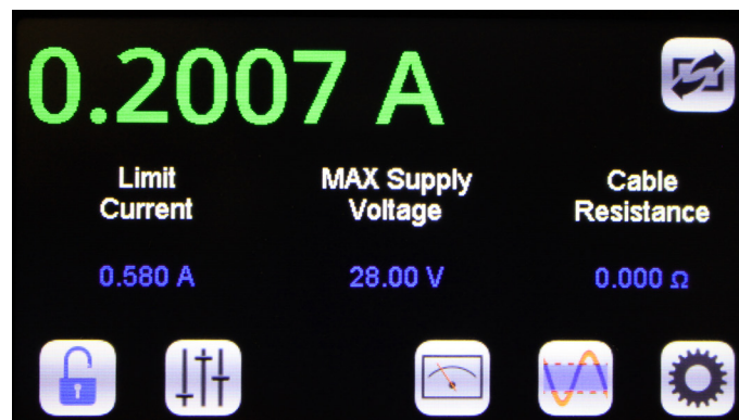
Figure 3. Limit Screen